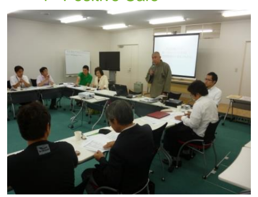
1st Positive Cafe