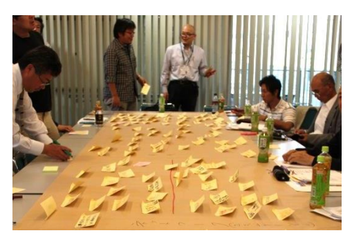
Positive Cafe @ Minami-Soma