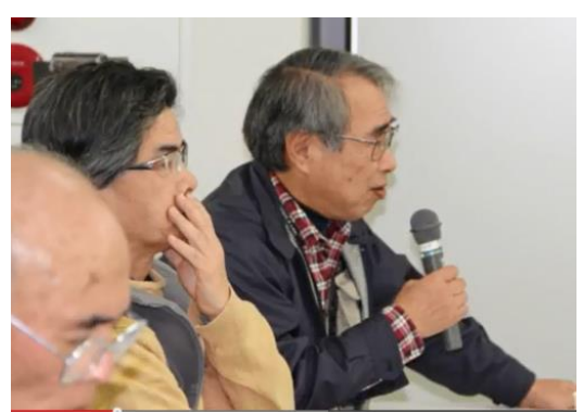
2<sup>nd</sup> Positive Cafe