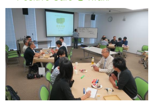
Positive Cafe @ Iwaki